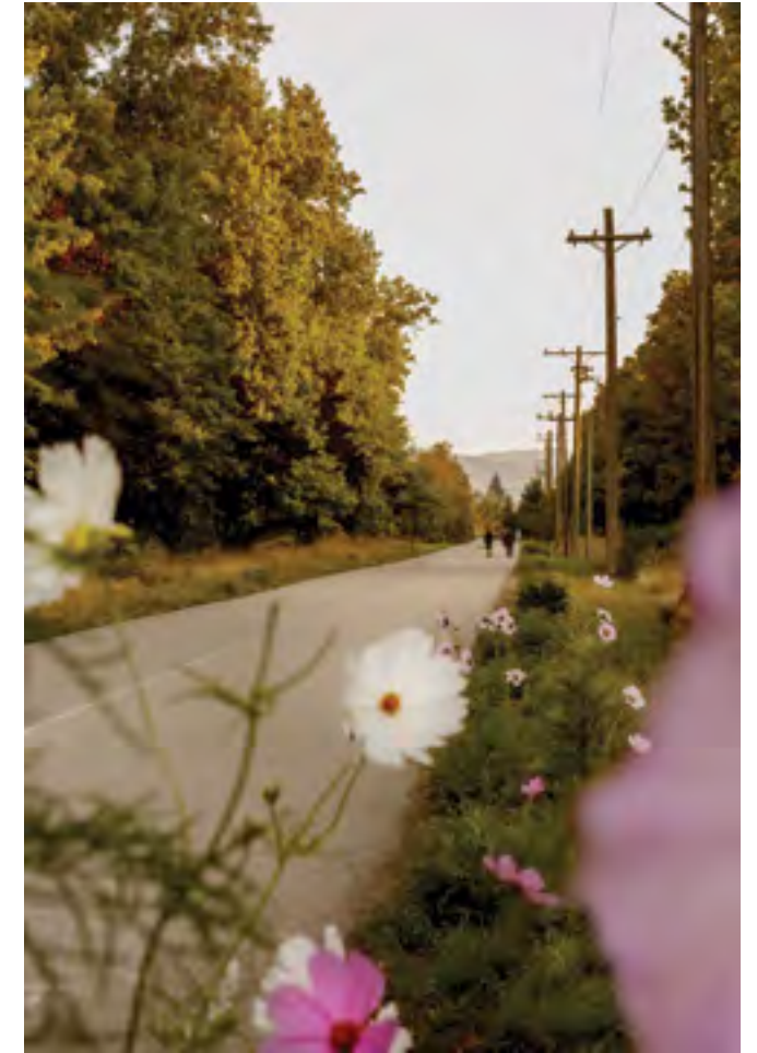
THE ARBUTUS GREENWAY IS ONE OF THE LONGEST LINEAR URBAN PARKS IN THE WORLD.

Stroll through the Arbutus Greenway, a world-class urban park connecting the Fraser River to False Creek. Explore the comforts of Kerrisdale with artisanal cafés, gardens, bike paths and community spaces that enrich the park and your daily routine.