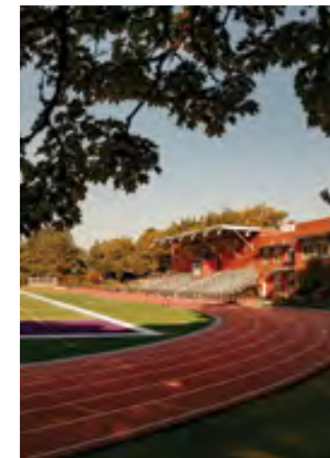
ENJOY BOUTIQUE SHOPPING, GOURMET DINING, AND STATE-OF-THE ART RECREATION AT YOUR DOORSTEP.