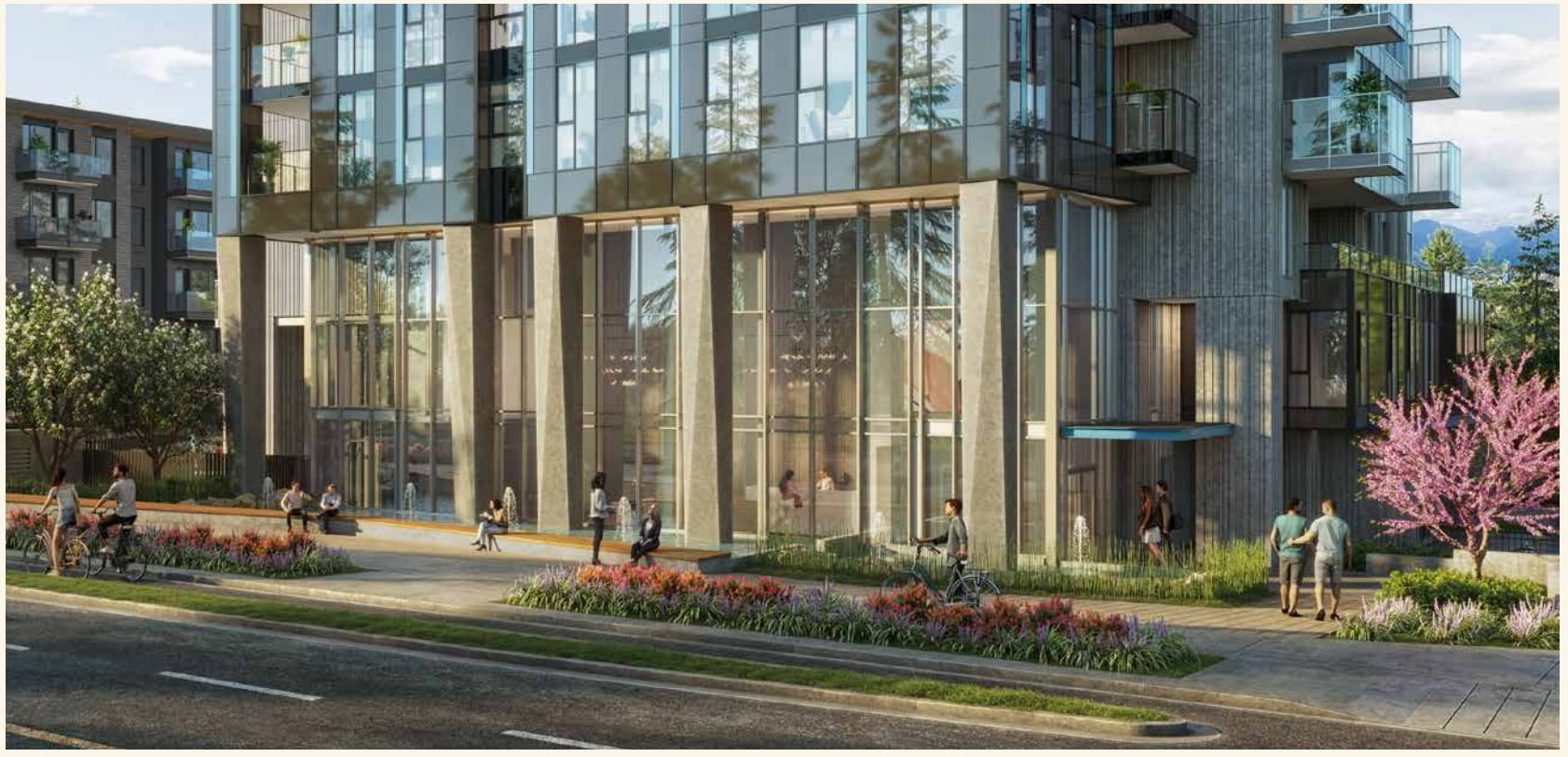
RWA GROUP ARCHITECTURE