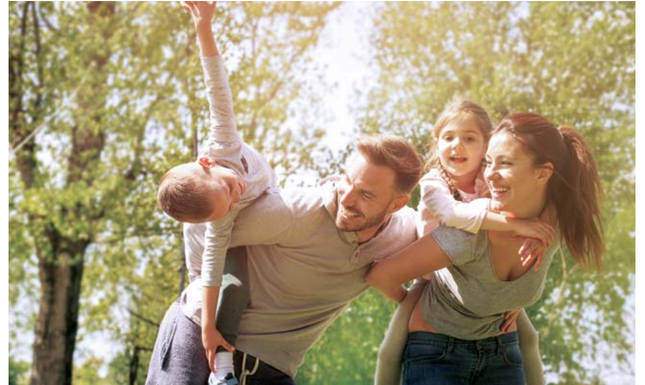
PARKS AND GREENSPACE AROUND IN THE NEIGHBOURHOOD.

Aviary's incomparable location is just minutes from Richmond Centre and its exclusive shopping and wealth of dining options. And with easy access to the Canada Line, you are minutes to YVR and all that downtown Vancouver offers.