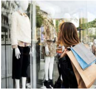
GLOBAL BRANDS AND LOCAL SHOPS ARE A SHORT WALK AWAY.