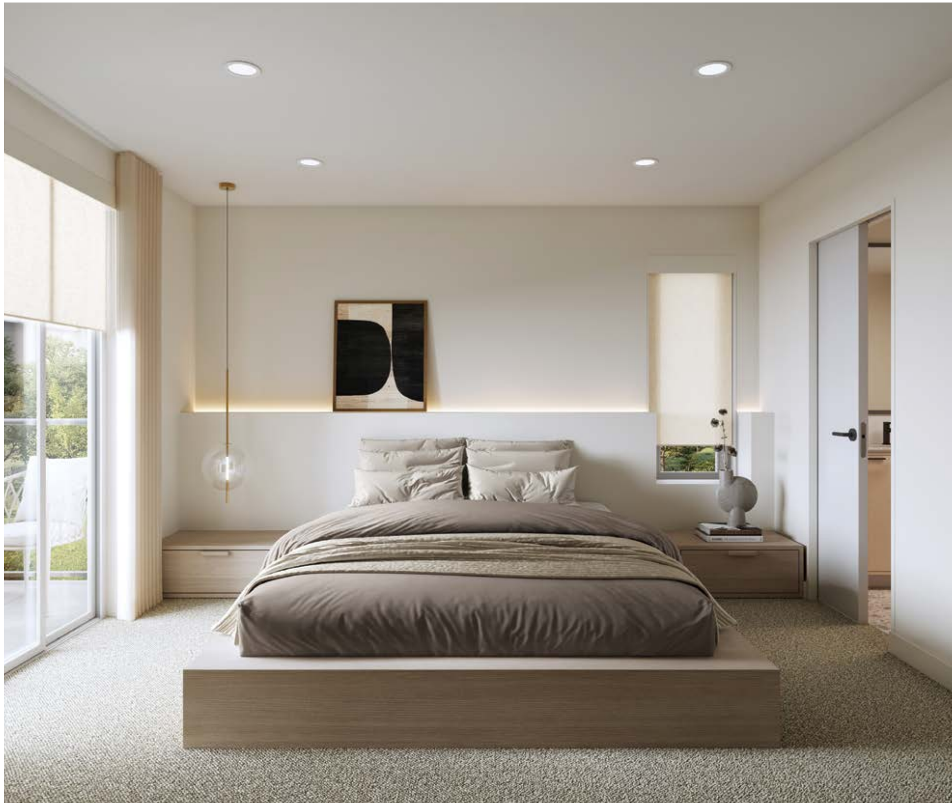
WARM, CALMING INTERIORS INSPIRE RELAXATION.

The thoughtful design of Avary extends throughout the interiors where materials inspired by natural textures are the perfect backdrop for your personal style. The airy, master retreat has an expansive, walk-in closet for ample storage.