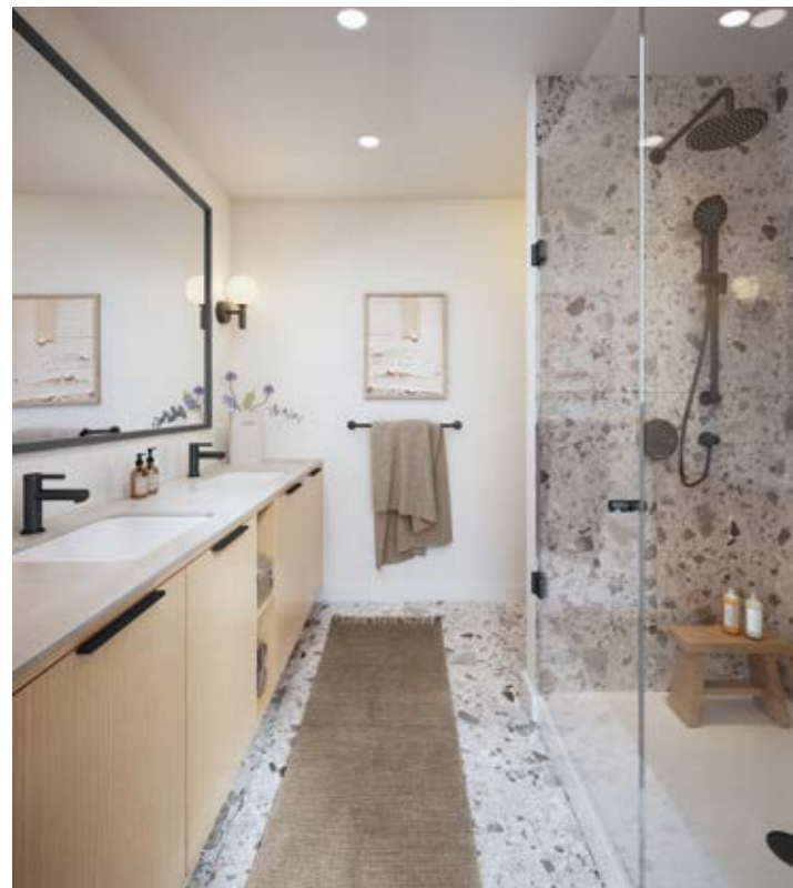
BATHROOMS CREATED TO PAMPER AND SOOTHE.

Graceful, organic, contemporary interiors define the master retreat.