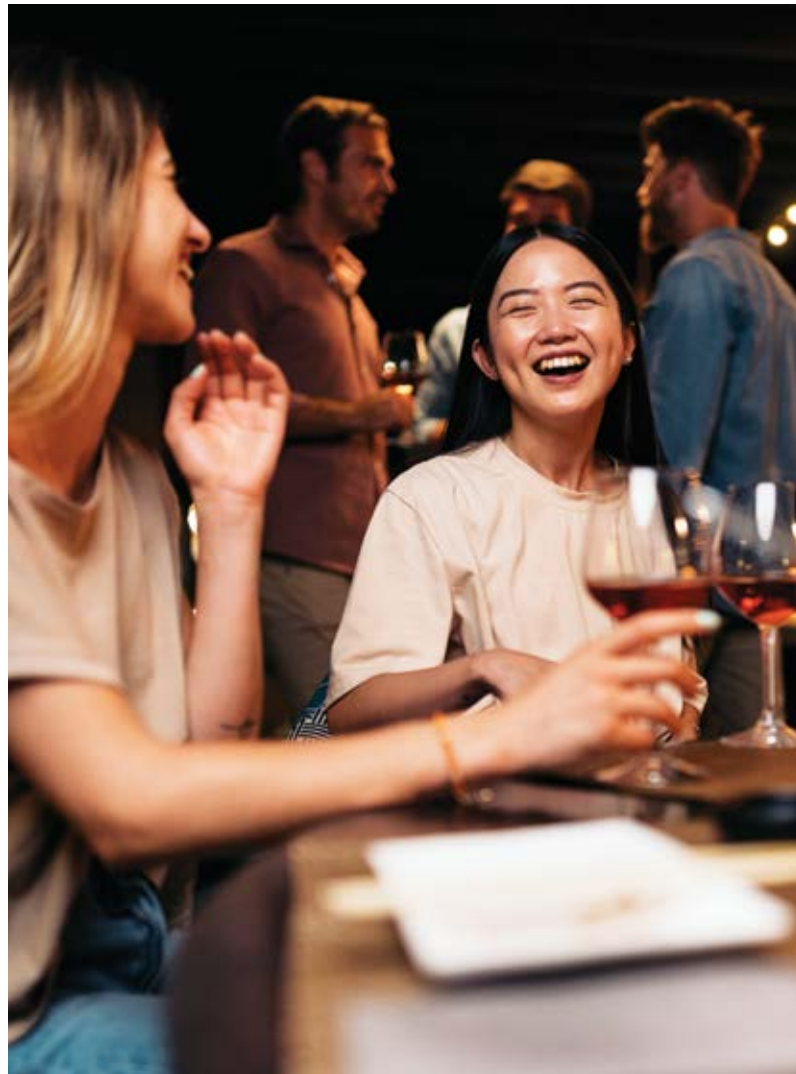
FROM CASUAL DRINKS TO FINE DINING, THE CHOICE IS YOURS.

Aviary's incomparable location is just minutes from Richmond Centre and its exclusive shopping and wealth of dining options. And with easy access to the Canada Line, you are minutes to YVR and all that downtown Vancouver offers.