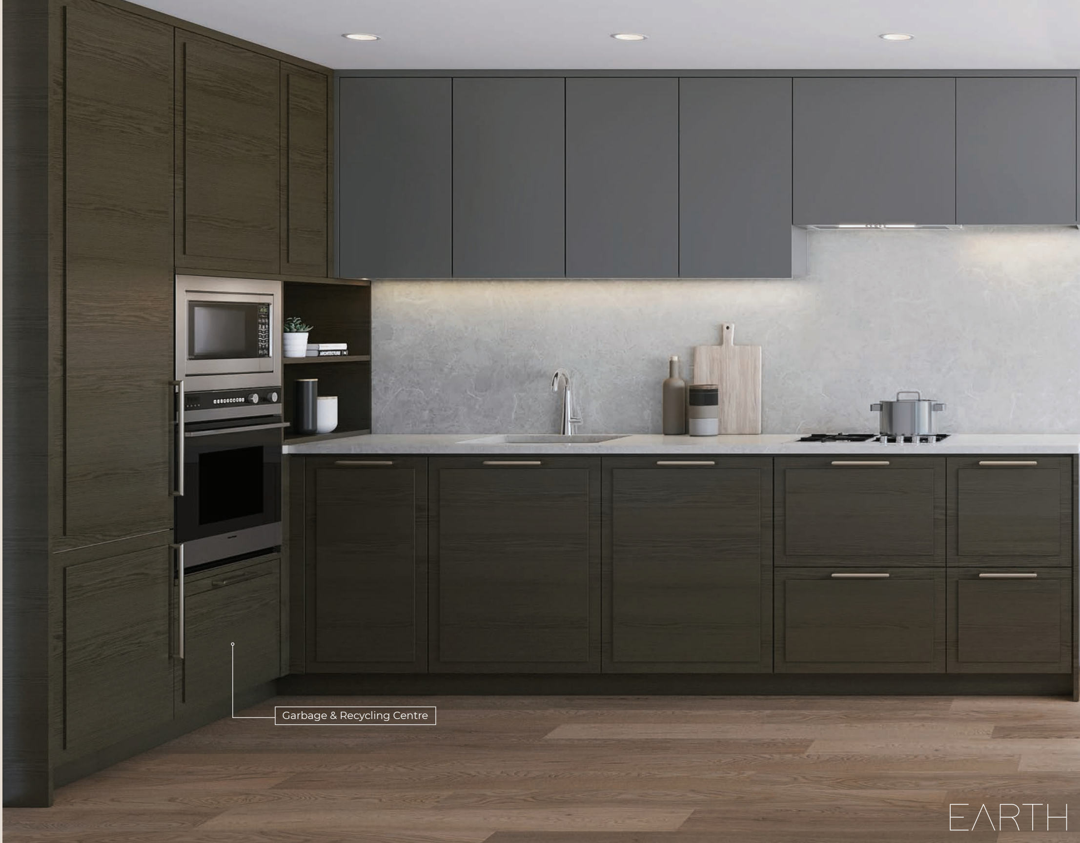
Garbage & Recycling Centre