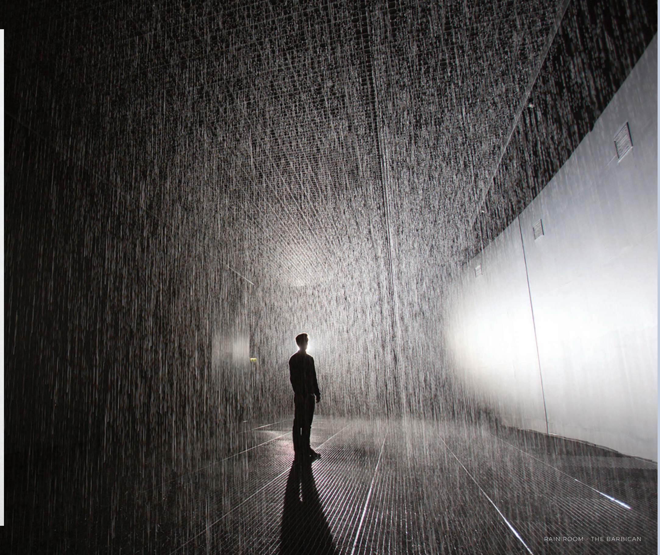
RAIN ROOM - THE BARBICAN