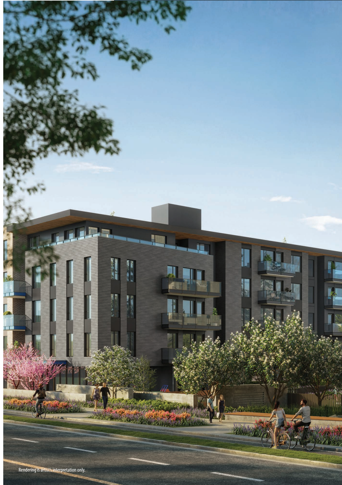
Rendering is artist's interpretation only.

Qualex-Landmark recognizes the housing needs of the wider community. We are planning a partnership with the YWCA to develop a sister, five-storey, 32-home building designed to house single mothers and their children.