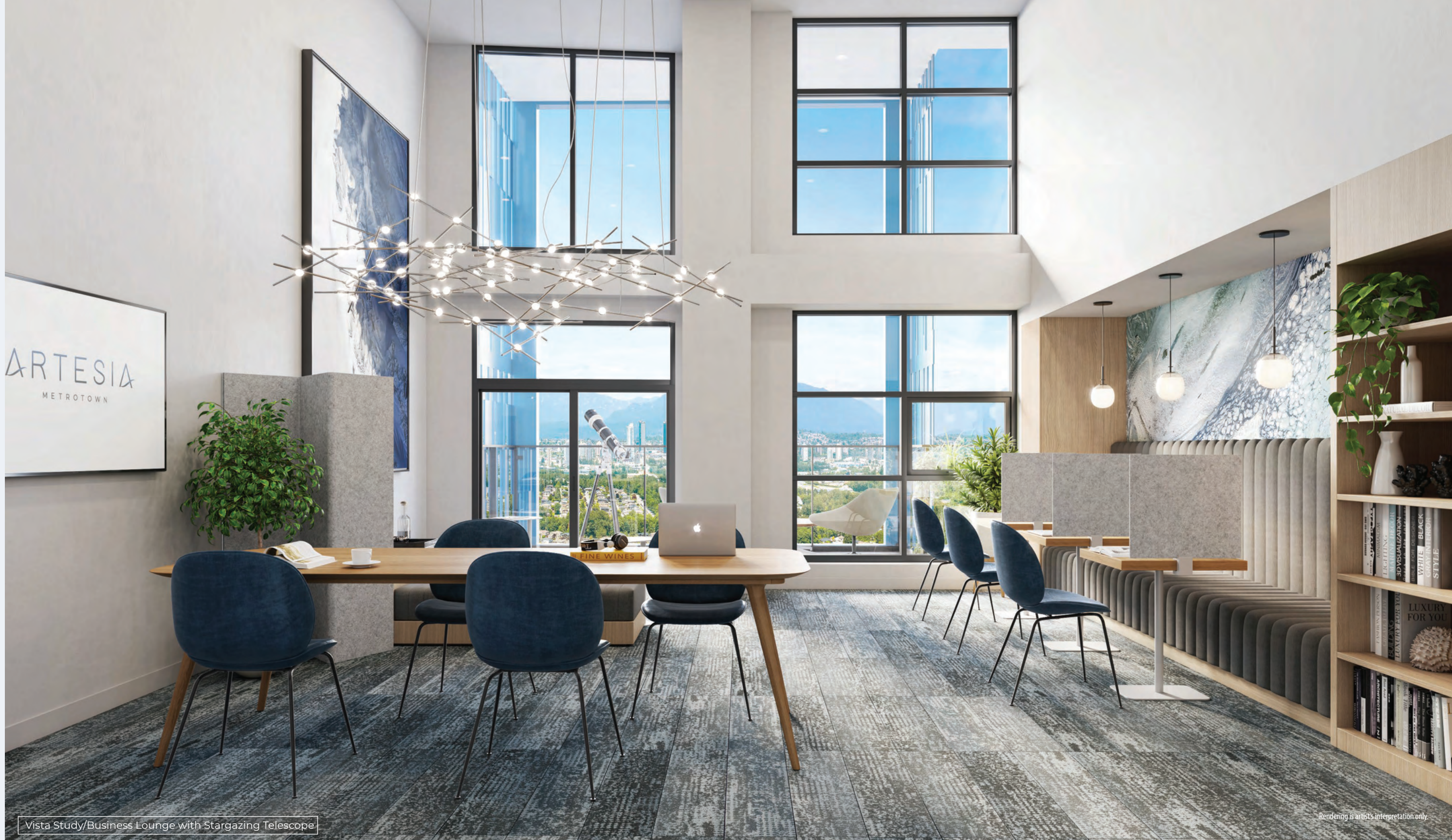
Vista Study/Business Lounge with Stargazing Telescope

Rendering is artist's interpretation only.