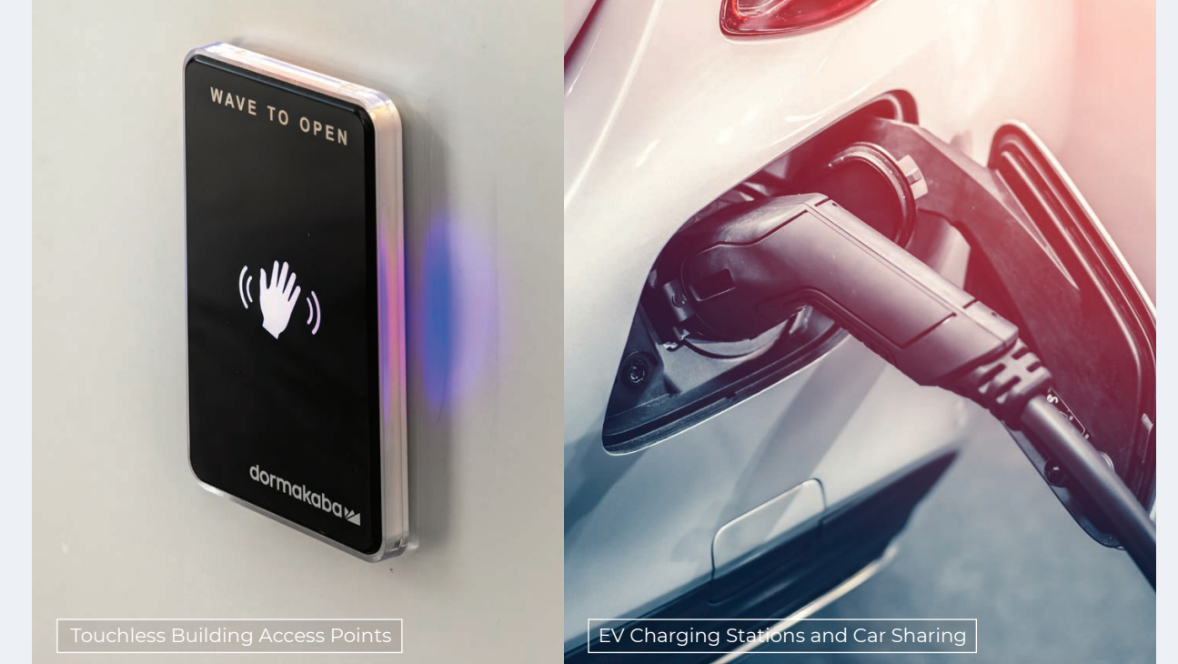
Touchless Building Access Points

You can rest assured that Artesia has been built with your future in mind. There's a 1-2-5-10 year warranty for all the peace of mind you deserve. What's more, there's a priority on providing a healthier environment, with sanitization and water filtration stations, enhanced air quality thanks to in-suite recovery ventilation units, and a state-of-the-art professionally managed mechanical system.