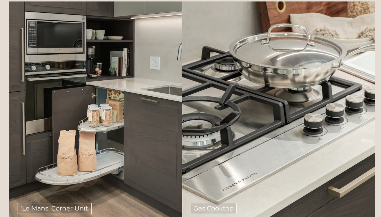
'Le Mans' Corner Unit

Refined Italian cabinetry paired with quartz countertops and backsplashes ensures the kitchens are as beautiful as they are functional. Cleverly positioned cupboards and a hidden 'Le Mans' corner unit with out-swinging shelves maximize storage space. Under-cabinet lighting and an undermount stainless steel sink with a Grohe faucet accentuate the clean contemporary lines.