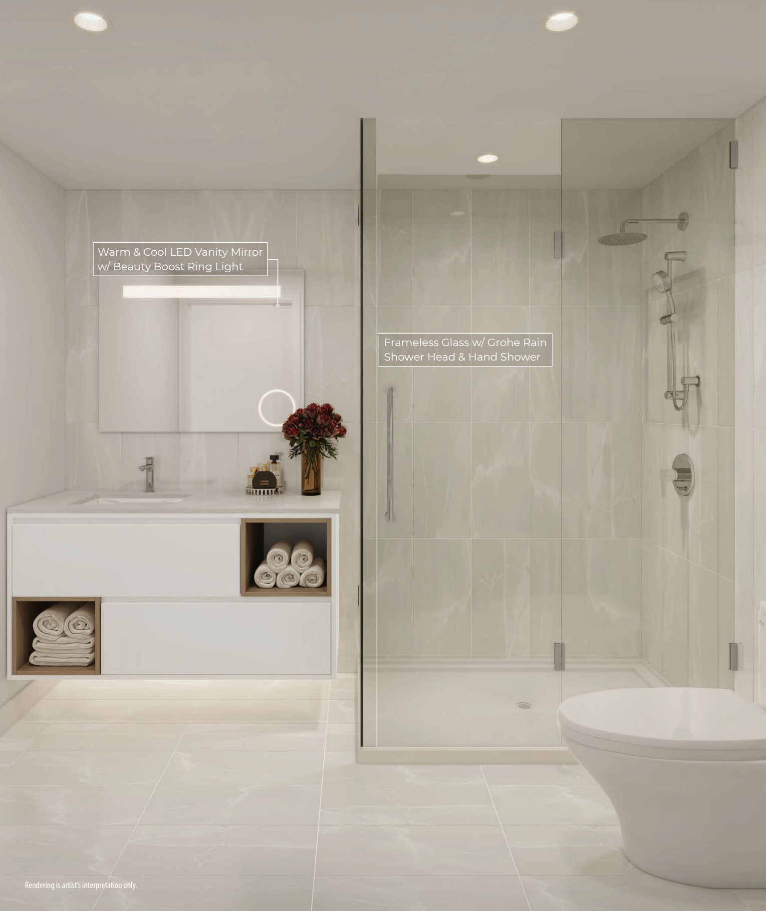
Warm & Cool LED Vanity Mirror w/ Beauty Boost Ring Light