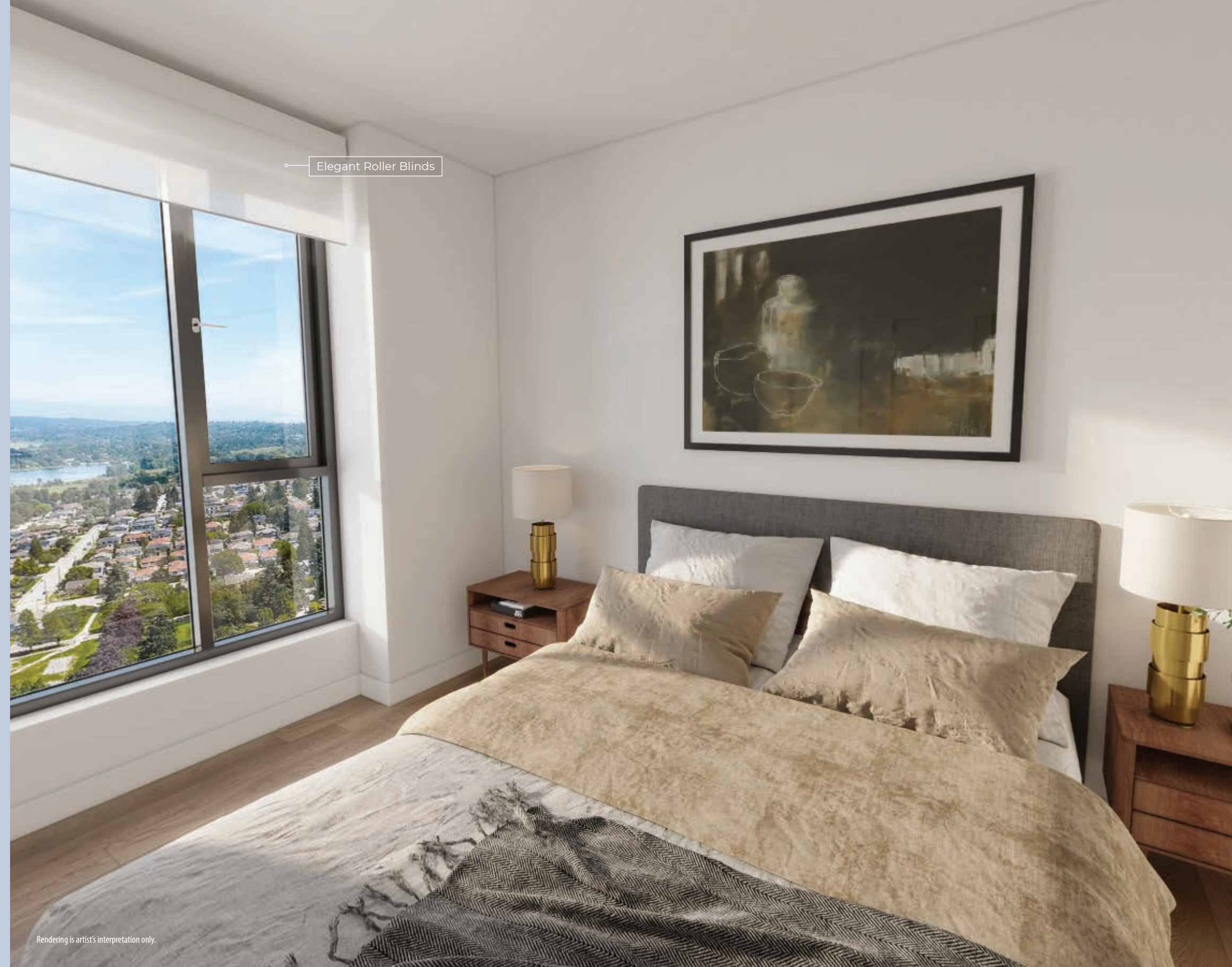
Elegant Roller Blinds

Homes are finished to the highest standards of craftsmanship with imported Italian cabinetry and quartz countertops. Underfoot, there's luxury laminate in the main rooms and elegant porcelain in the bathroom. Comfort and convenience is the priority with a responsive heating and cooling system and in-suite laundry.