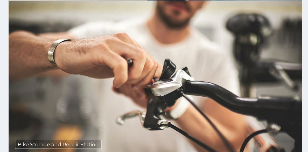
Bike Storage and Repair Station