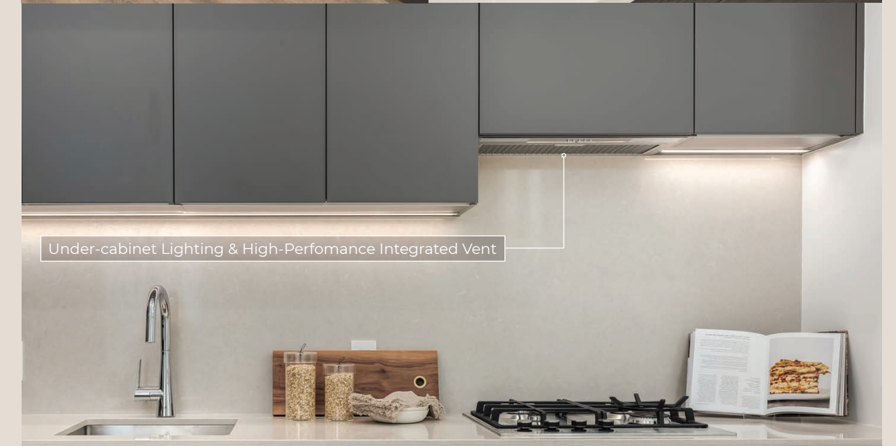
Under-cabinet Lighting & High-Performance Integrated Vent